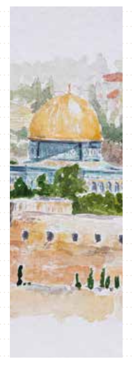
JERUSALEM AND ISTANBUL ON THE SAME CANVAS