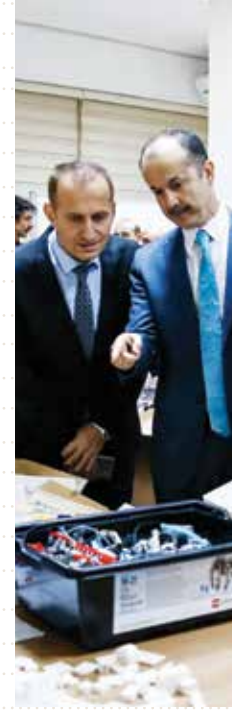
ROBOTICS TRAIN- ING FOR SYRIAN CHILDREN