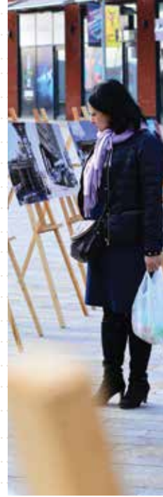
"JULY 15 TH EXHIBITION" IN TBILISI