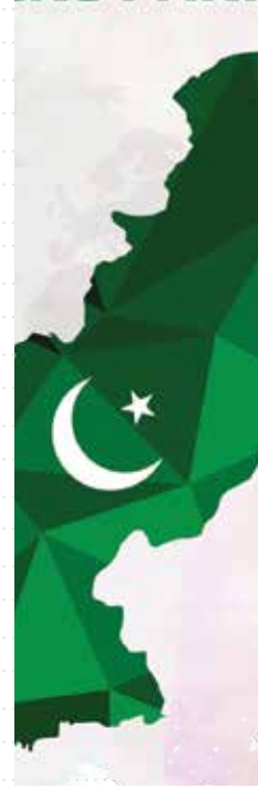
YUNUS EMRE ENSTITÜSÜ IN SISTER COUNTRY PAKISTANI