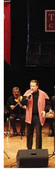
IN DOHA "TURKISH CUL- TURE DAYS"