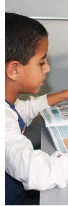
A FIRST IN TURK- ISH INSTRUCTION IN EGYPT