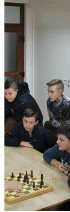
TABLE TENNIS AND CHESS TOURNAMENT IN KISELJAK